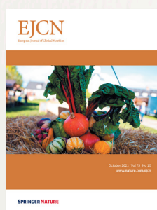
European Journal of Clinical Nutrition Online ISSN : 1476-5640