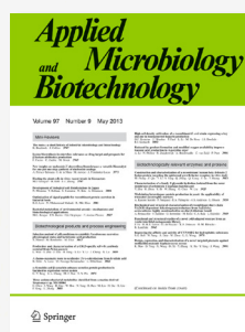
Applied Microbiology and Biotechnology Online ISSN : 1432-0614