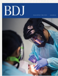
British Dental Journal Online ISSN : 1476-5373