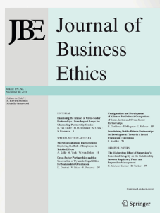
Journal of Business Ethics Online ISSN : 1573-0697