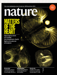
Nature Online ISSN : 1476-4687