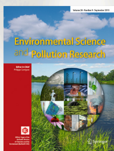
Environmental Science and Pollution Research Online ISSN : 1614-7499