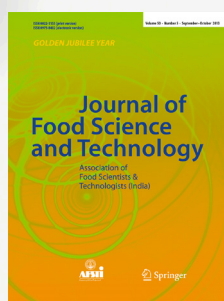
Journal of Food Science and Technology Online ISSN : 0975-8402