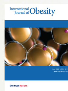
International Journal of Obesity Online ISSN : 1476-5497